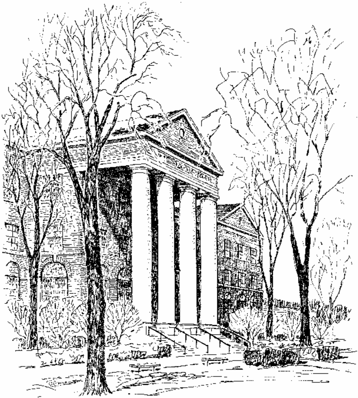
The Earl F. DeMarse Corrections Academy Location of Michigan Correctional Officers' Training Council Offices