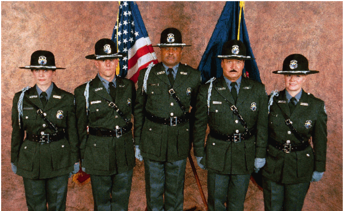
MDOC Honor Guard

Two amendments to Public Act 415, Public Act 44 of 1985 and Public Act 4 of 1989, provided further support to the belief that the corrections officer position is one requiring post high school education including specific reference to possession of associate and bachelor degrees as being acceptable for entry into the corrections officer position. In 1989, the National Institute of Corrections awarded a grant to the International Association of Corrections Officers (IACO) to develop a college level vocational certificate program for corrections officers; much of the content of their program was based on the Michigan model.