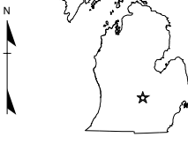
0 1 2 3 SCALE IN MILES 09547.8A 19-9