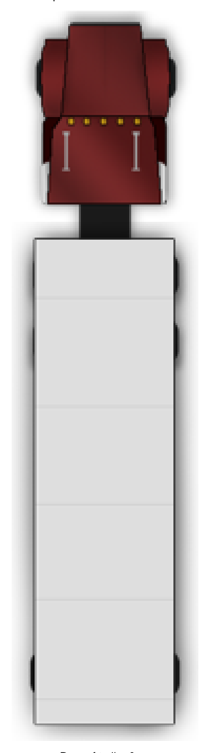
Rear of trailer & lights/reflectors