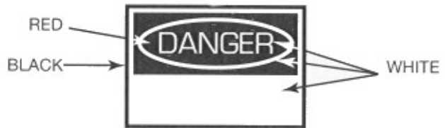
Figure 1 Danger Sign