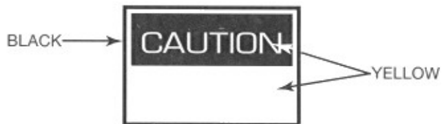
Figure 2 Caution Sign