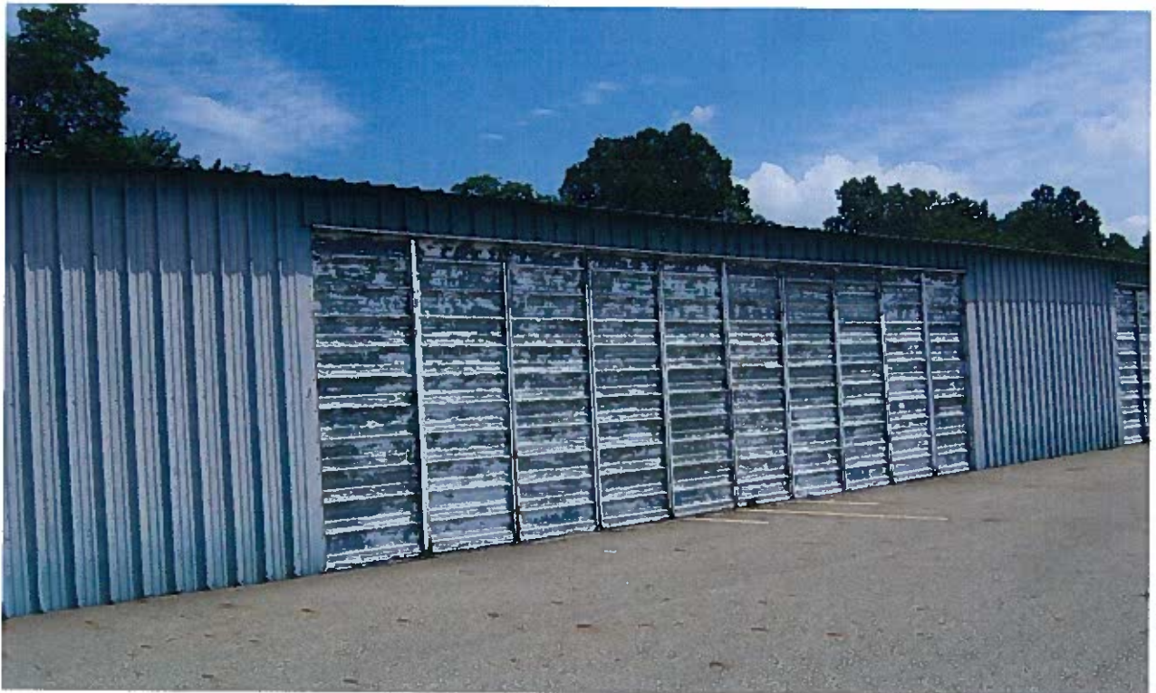
Existing Door Condition