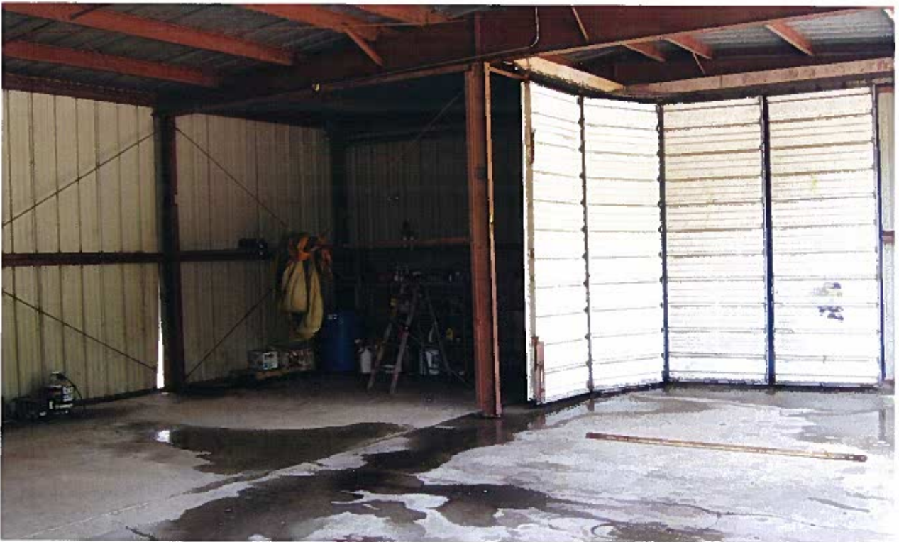
Leaking Walls and Door