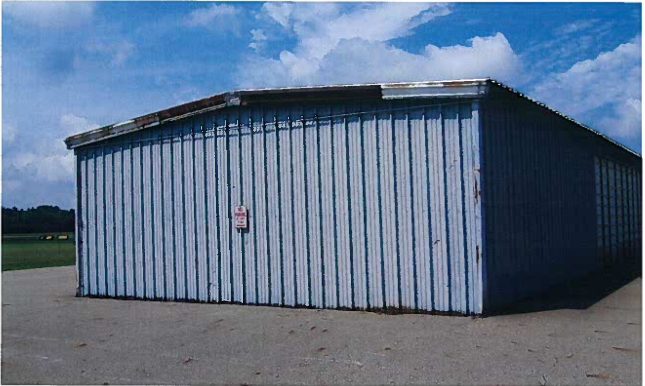
East Hangar Elevation