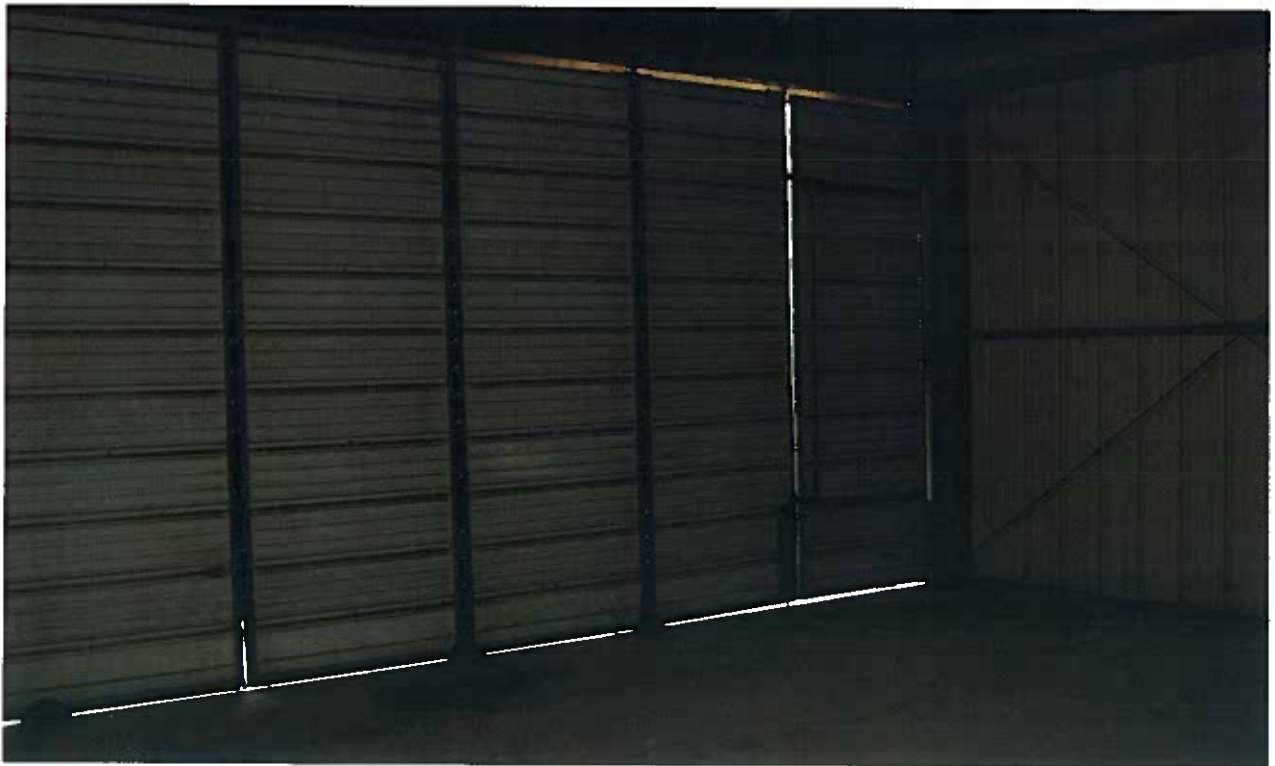
Southwest Hangar Door Interior