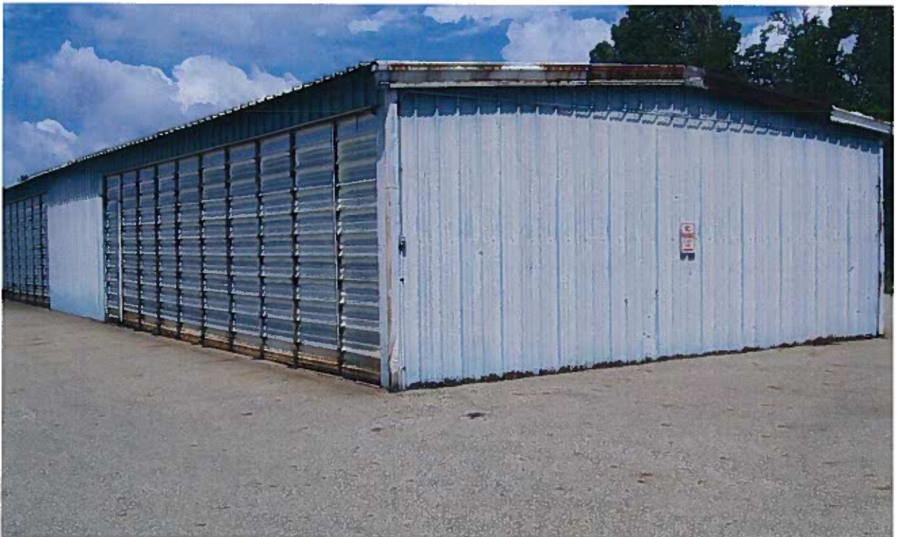
Southeast Corner Hangar