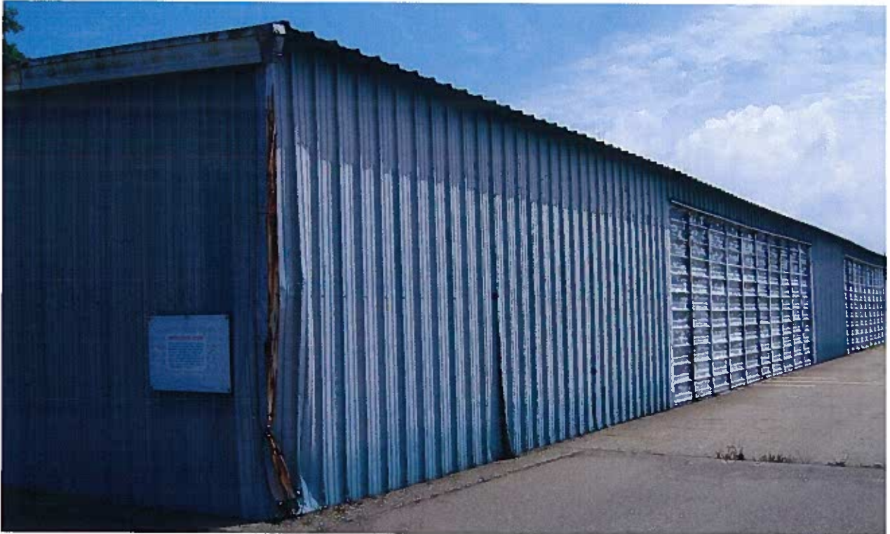
Southwest Hangar Siding