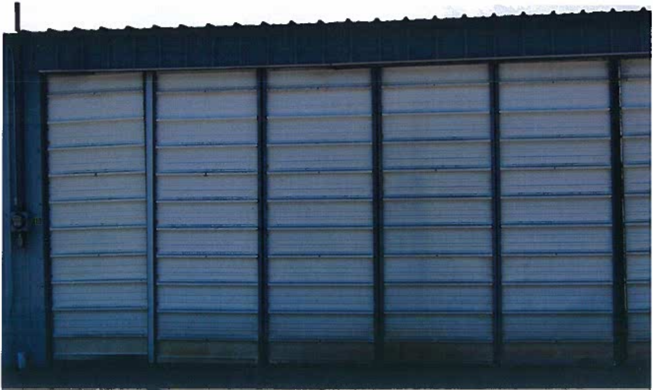
North Side Hangar Door