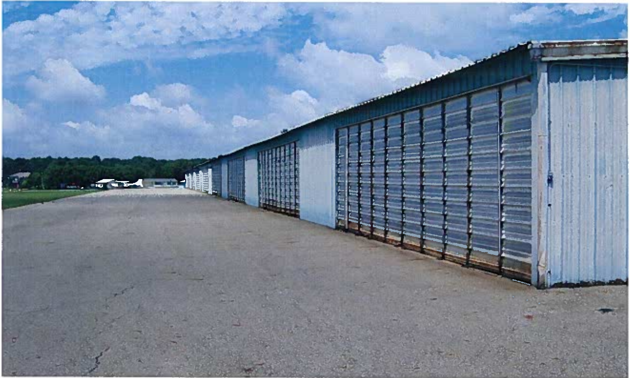
South Hangar Exterior