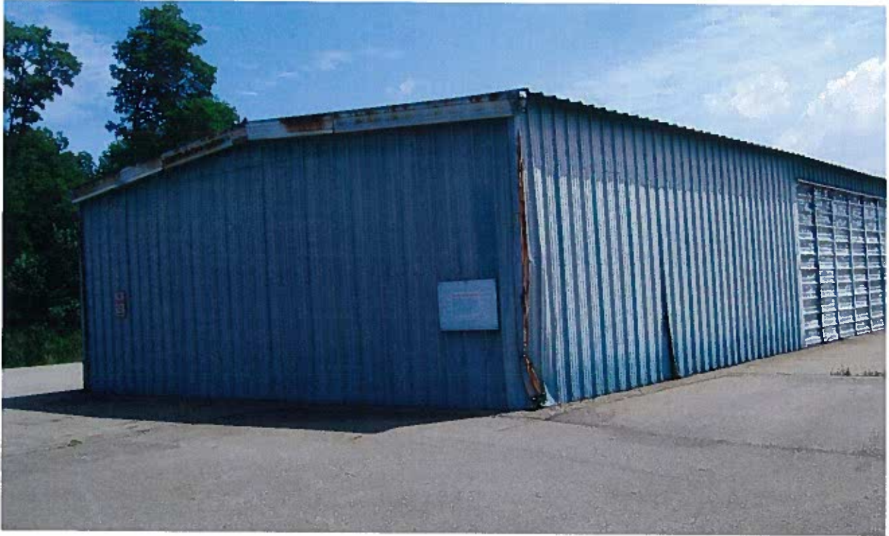
West Hangar Elevation