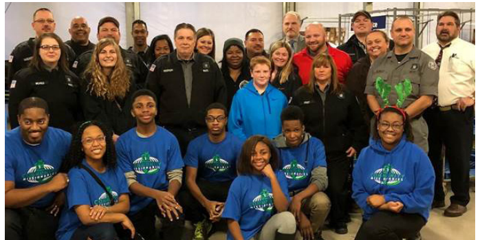
Pictured: Ionia Correctional Facility staff participate in Shop with a Hero (left), Saginaw Correctional Facility staff participate in Shop with a Cop (right)