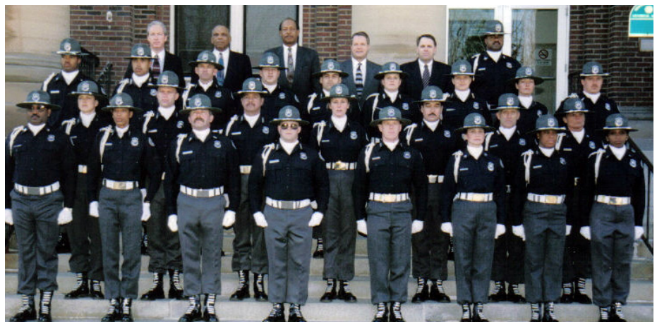
Pictured above: The 1998 MDOC Honor Guard.