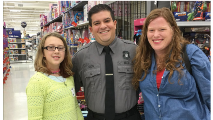
Pictured: Woodland Center Correctional Facility staff participate in Shop with a Cop

During the events, children in need were given money and paired with an officer to help them shop for the holidays.