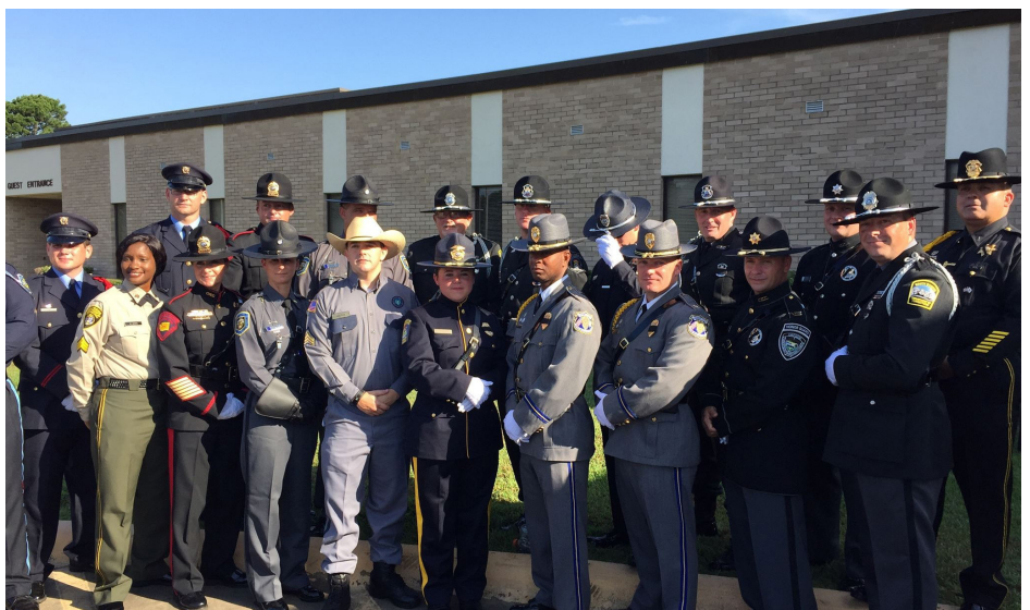
Pictured above: The MDOC Honor Guard on detail for a fallen officer in Texas.

New members must have two years of experience with the MDOC and be willing to make a five-year commitment to the unit.