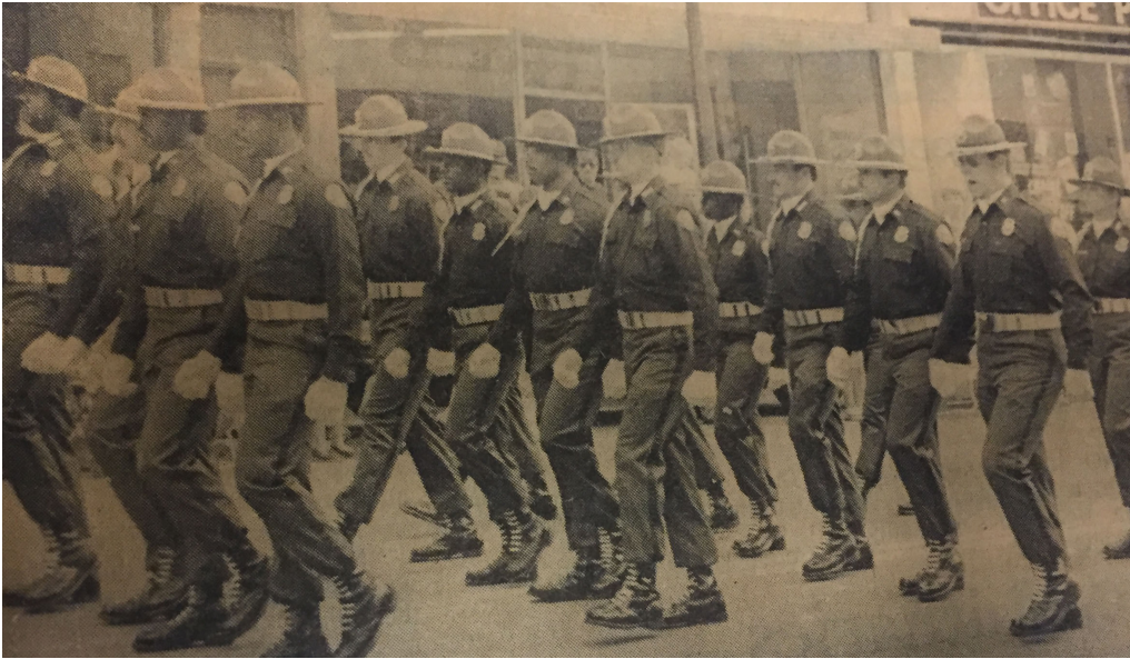
Pictured above: The MDOC Honor Guard participates in a parade in Ionia in 1989.

Incarceration Facility. “Sometimes people look at this job and they don’t realize how tough it is and how dangerous it is.”