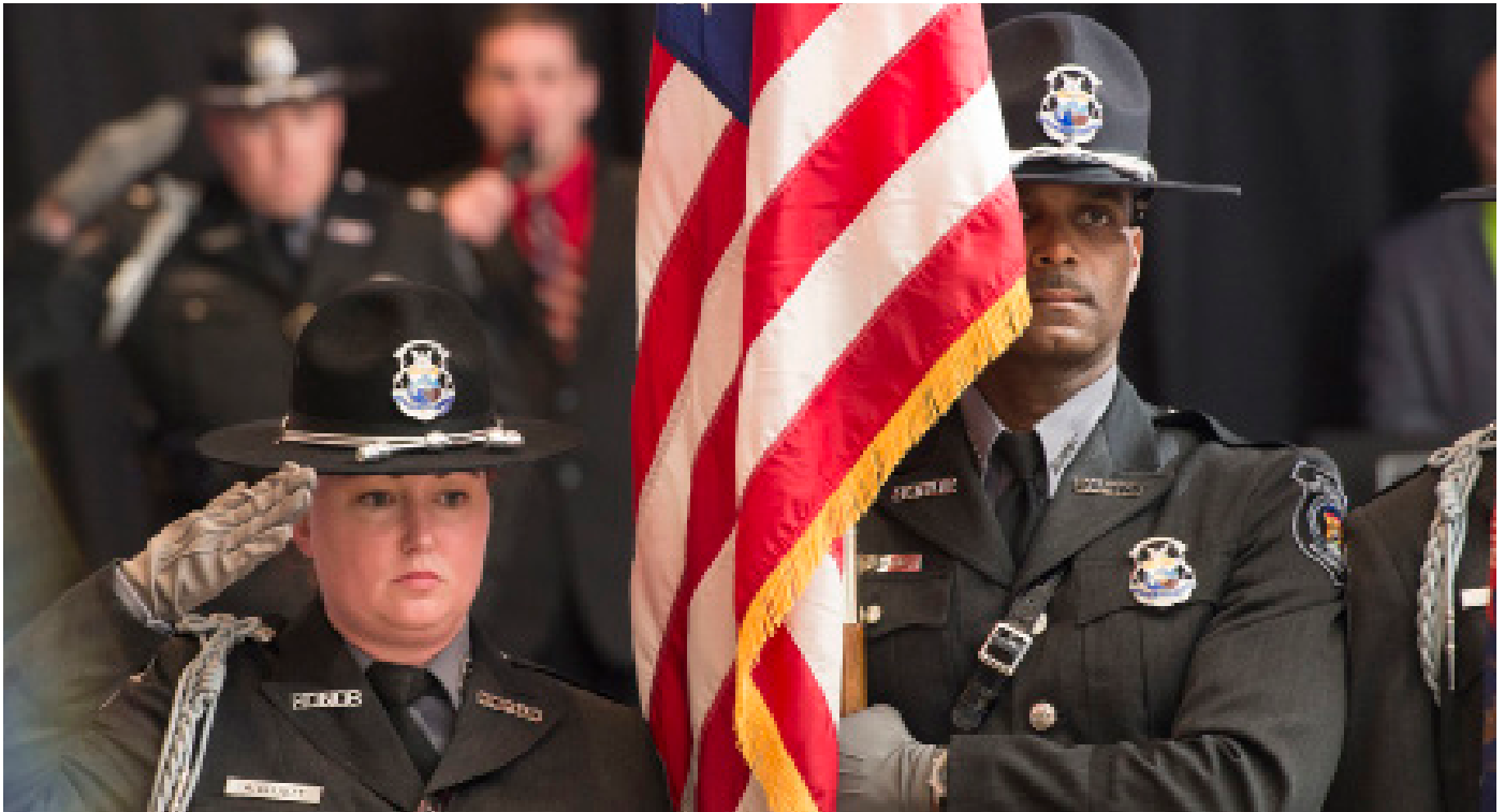
Pictured above: MDOC Honor Guard members salute the flag during the national anthem at the 2016 Employee Appreciation Banquet.