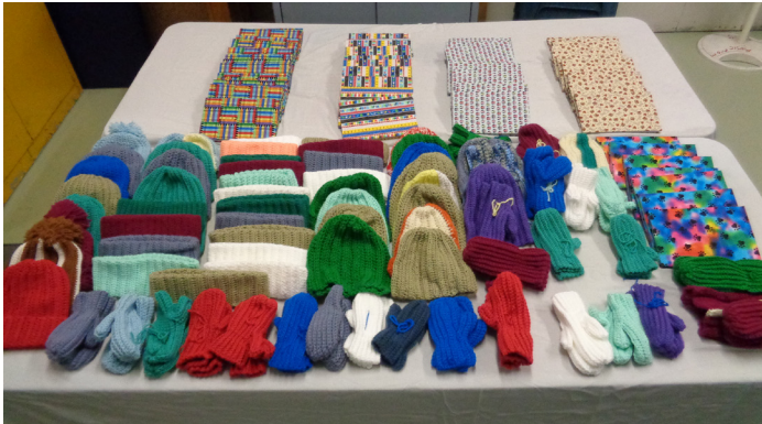
The Chippewa Correctional Facility East and West Crochet Club and West Book Building Club handmade items to be donated to Soo Township Elementary and Washington Schools for students. In the fall of 2016 a donation of crochet hats, mittens, and headbands was made to Soo Township.