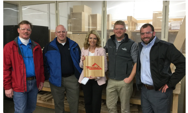
Grand Rapids-based Triangle Construction toured the Vocational Village at Richard A. Handlon Correctional Facility. Carpentry students in the program made a plaque with the company's logo using a CNC wood engraving machine. Company representatives expressed that they were impressed with the trades programs and would be interested in hiring paroling students.