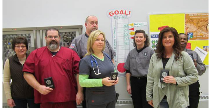
Employees at Charles E. Egeler Reception and Guidance Center (top) and Duane Waters Health Center (bottom) show off notebooks they received for completing the survey. The facilities also celebrated survey completion by giving employees the opportunity to dunk their favorite administrator in a dunk tank.