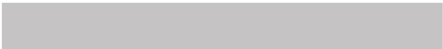
Top: Rolex as a puppy at Baraga Correctional Facility. Bottom: Rolex participating in harness training.

Prisoners at Baraga Correctional Facility work to train up to eight dogs at a time to become leader dogs for individuals with visual impairments. Puppies are brought to the facility at approximately two months old and spend about a year to 15 months learning basic socialization and obedience. Afterward, the dogs participate in four months of formal harness training with a professional guide dog mobility instructor where they learn skills such as stopping at curbs, avoiding obstacles and finding doors. Leader Dogs for the Blind has training programs at eight correctional facilities in Michigan.