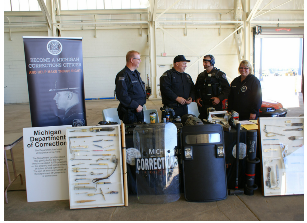
Kinross Correctional Facility staff help teach the community about corrections during a 40th anniversary event for Kincheloe Air Force Base.