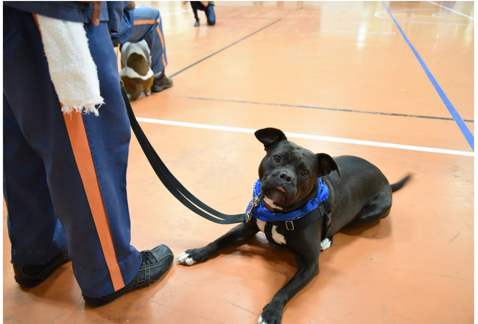
Above: A prisoner handler and dog participate in a recent training session at Thumb Correctional Facility with the Stiggy’s Dogs program.