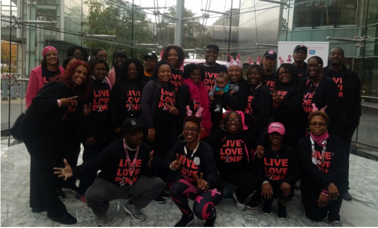
The Detroit Metro and Lincoln Park parole offices participated in the Making Strides Against Breast Cancer walk in Detroit in October. The “Sole Steppers” team raised almost $1,000 to support breast cancer research.