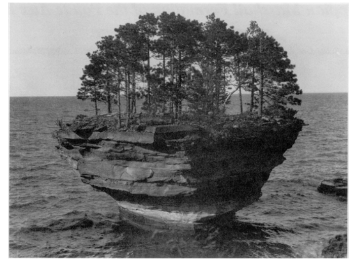
Figure 2. The Flagstaff (or Bowsprit) at Pointe aux Barques. This small island was formed by wave action of the ancient and modern Great Lakes.

wave-cut cliffs (Fig. 2). These dramatic shoreline structures are the result of changes in water level of the ancient and modern Great Lakes.