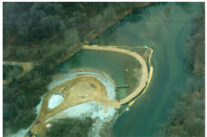
Excavation area within temporary berms

After excavation, the retaining berm was raked over the river area. The landfill area was graded to promote positive drainage with minimal erosion; an interim cover of a six-inch thick layer of sand was installed.