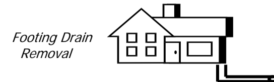
Footing Drain Removal