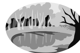
Non Point Source and Storm Water Treatment