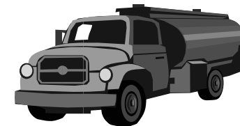
Septage Acceptance/ Treatment Facilities