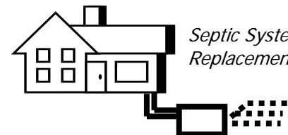
Septic System Replacement