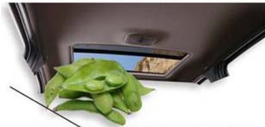
Soy foam headliner

Status: Ford is leader in technology and first OEM to launch in production; migration to other non-automotive applications