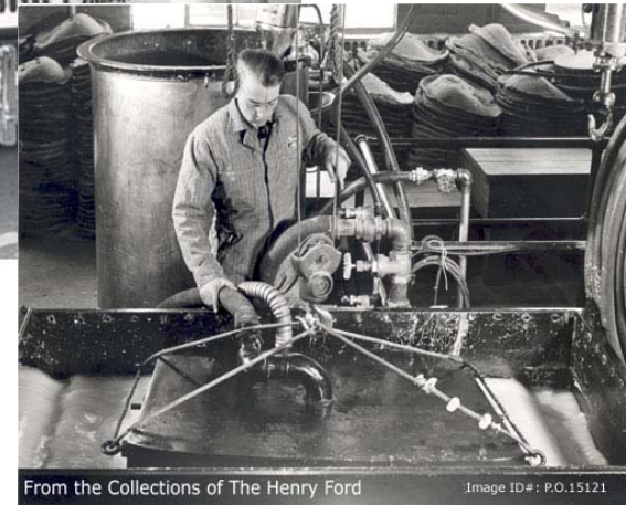
From the Collections of The Henry Ford Image ID#: P.O.15121

Soybean Car assembly image showing production of plastic panels.