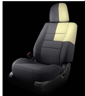
Soy foam seats