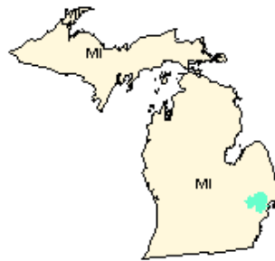
Pontiac Creek Watershed Location