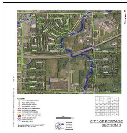
Davis, Gourdneck, Portage Creek Watershed Management Plan

City of Portage Kalamazoo County Drain Commissioner Michigan Department of Environmental Quality West Lake Association Austin Lake Association Gourdneck Lake Association Austin Lake Board Long Lake Board Fishbeck, Thompson, Carr & Huber, Inc.