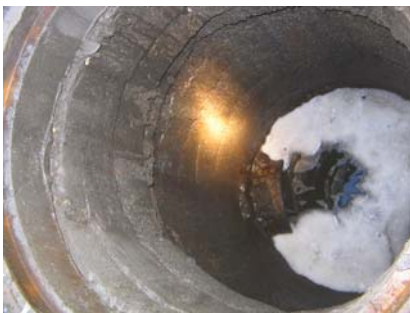
Employees of business found disposing of wash water and waste oil in storm catch basin.