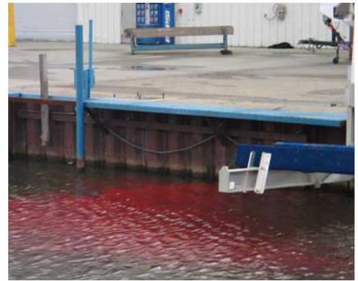
Marina found discharging sewage to Lake St. Clair.