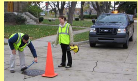
Opening manhole to inspect for tracing dye.