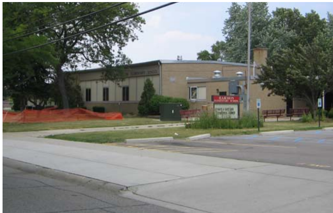
Recently installed bathrooms at institutional facility found discharging to storm drain