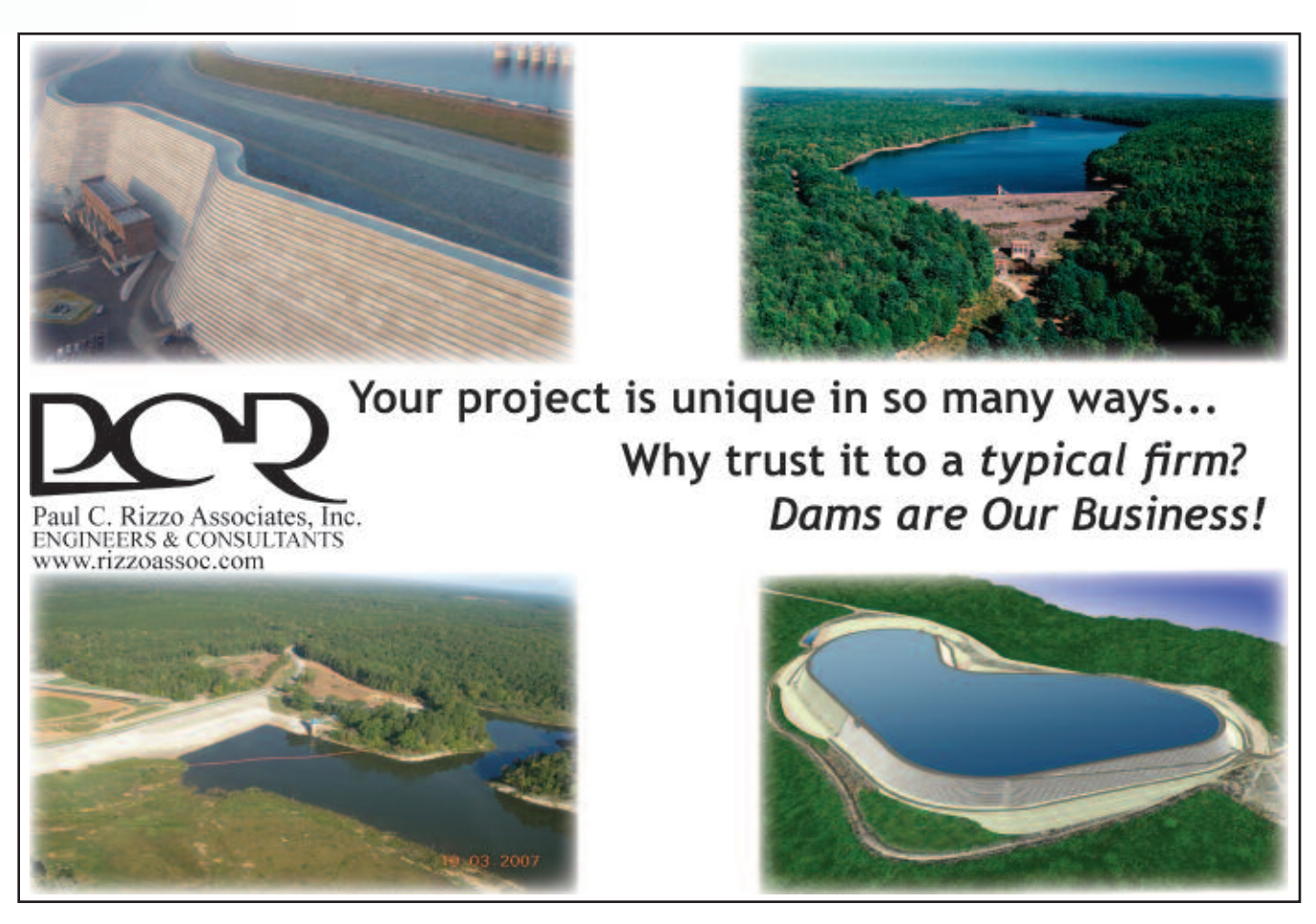
CIRCLE 4 ON READER INFORMATION CARD

As fate would have it, a flood scenario similar to the May 2003 event had been tested in 1998 during a "functional exercise" with dam operators, local officials, emergency management personnel, emergency response personnel, media, and state and federal agencies who would be responding to a dam breach.