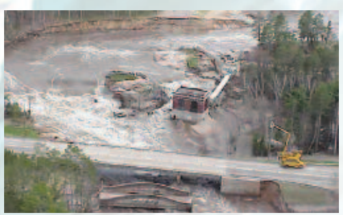
FIGURE 3: When the fuse plug in Silver Lake Dam failed, more than nine billion gallons of water unexpectedly rushed out of the reservoir and over Hoist Dam. No lives were lost and no major injuries occurred – thanks to an updated emergency action plan and a coordinated response of the part of all involved.

Silver Lake Dam is part of the Dead River Basin water system, which is approximately 25 miles long. The Silver Lake impoundment structures consist of the main earthen embankment, which incorporates a low-level outlet structure and a concrete overflow spillway, and four detached embankments (dikes) that fill low points in the reservoir shoreline near the main dam. Dike No. 2 was removed in September 2002 and was reconstructed as a fuse plug section to increase spillway capacity for extreme flood events.