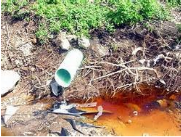
Fig 3. Illicit sewage discharge to a ditch.

For waterbodies and groundwater that are near failing septic systems, the nutrient concentrations will increase. A recent study by Michigan State University (MSU) found that all 64 rivers that they sampled in Michigan had human-specific, digestive bacteria present in them, indicating that human waste was a pollutant to the surface waters. Further analysis by MSU revealed that septic systems were the largest contributors of the human waste bacteria. E. coli bacteria contamination to surface waters is typically the most immediate concern with failing septic systems. However, a failing septic system will also contribute nutrients to local surface waters as well. In some cases, failing septic systems, or septic systems with inadequate drainfields can be the largest contributors of nutrients to a waterbody. A recent study by the United States Geologic Survey and Grand Valley State University that examined nutrient sources to a eutrophic lake in west Michigan found that septic systems of the homes along the lake were the biggest contributor of nutrients.