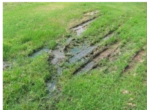
Figure 2. Saturated drainfield that has become clogged and has ponding water at the lawn surface.