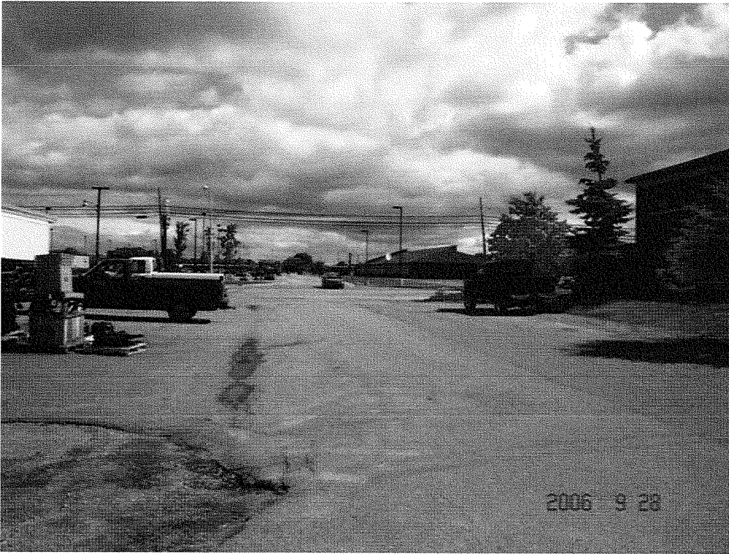
Photograph No. 3: View of northern boundary of subject Site looking east