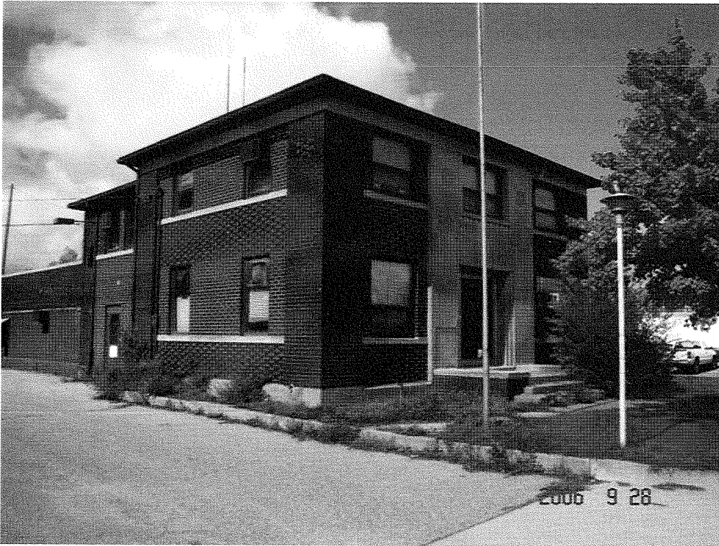
Photograph No. 1: View of structure on subject Site looking northwest from near the southeast corner of the property.