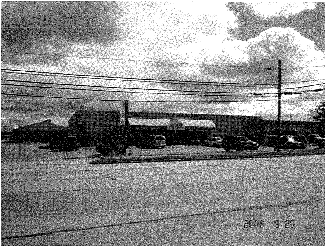
Photograph No. 8: View of adjacent commercial property to east across North Mission Street (Dollar Daze).