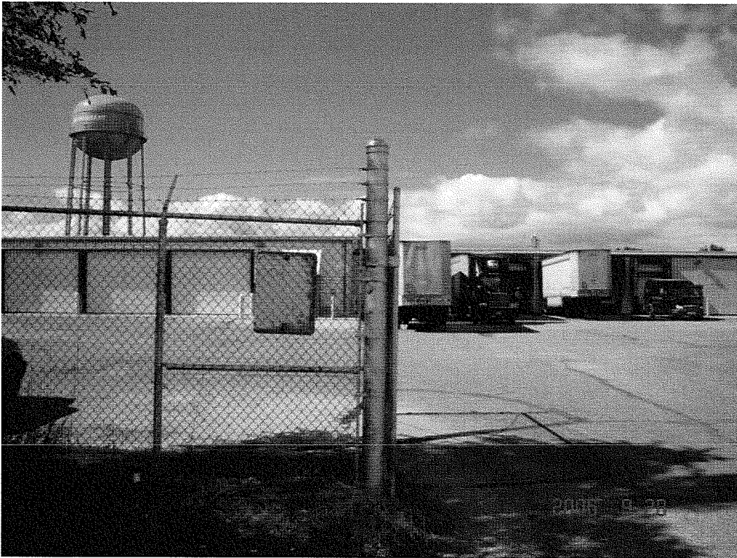
Photograph No. 4: View of adjacent property to west (FEDEX) from northwest corner of subject Site.