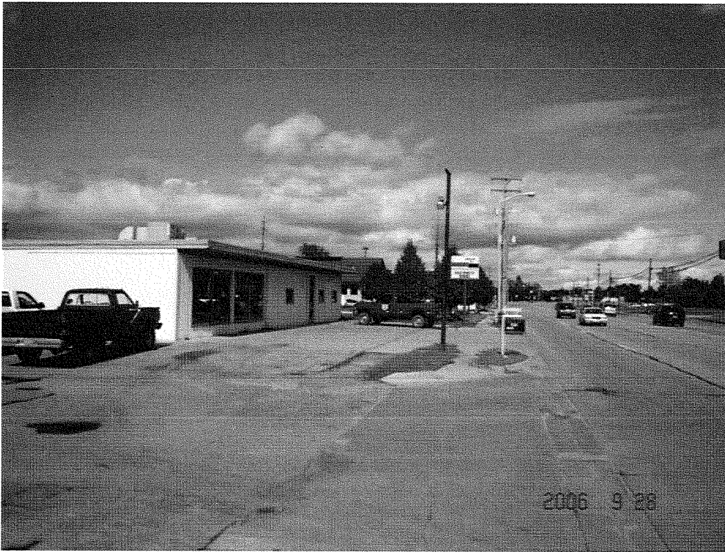
Photograph No 7: View of adjacent property to north (Southeast Brake) from the northeast corner of subject Site.