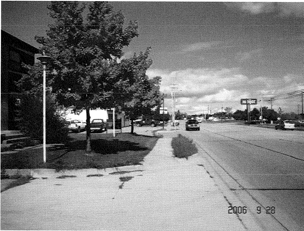
Photograph No. 2: View of the east property line looking north along North Mission Street.