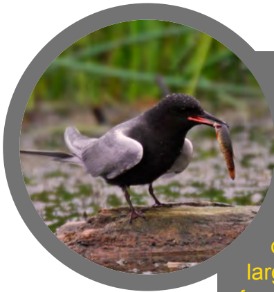
Black Tern (Chlidonias niger) Special Concern

Where we are now and what we think we can realistically achieve over the next 10 years.