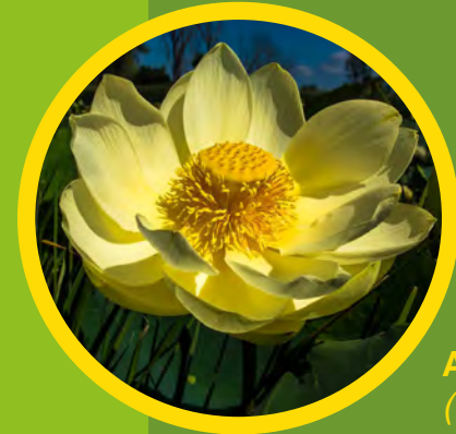
American lotus ( Nelumbo lutea )