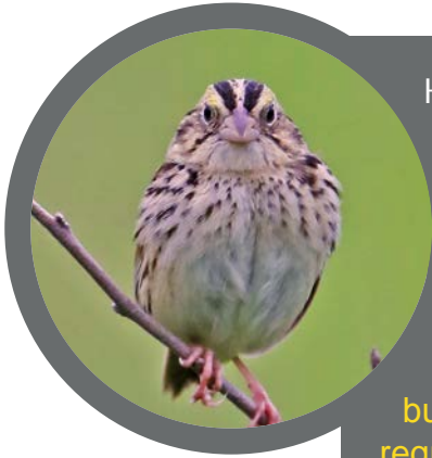
Henslow's Sparrow (Ammodramus henslowii) State Endangered

Where we are now and what we think we can realistically achieve over the next 10 years.