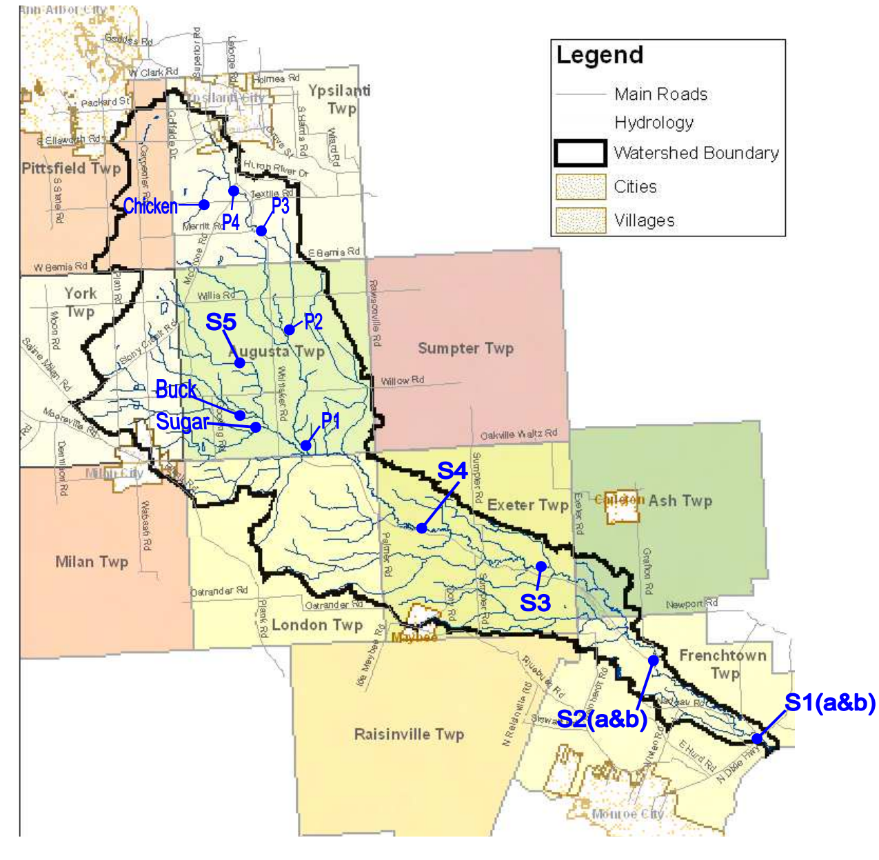
Figure 1. Stony Creek Watershed Map with sampling locations.

<u>SITE KEY</u> S1-2 = Lower Stony Creek (Dixie Hwy, Telegraph Rd)