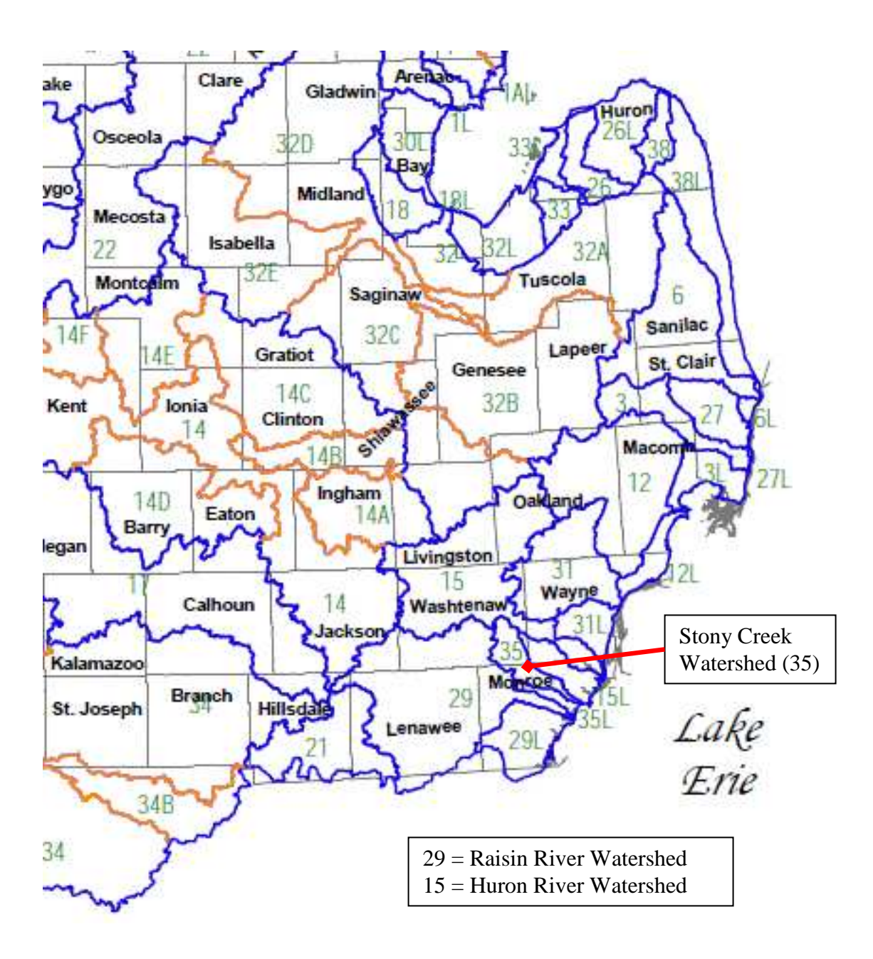
Figure 2. Southeast Michigan Watersheds Map