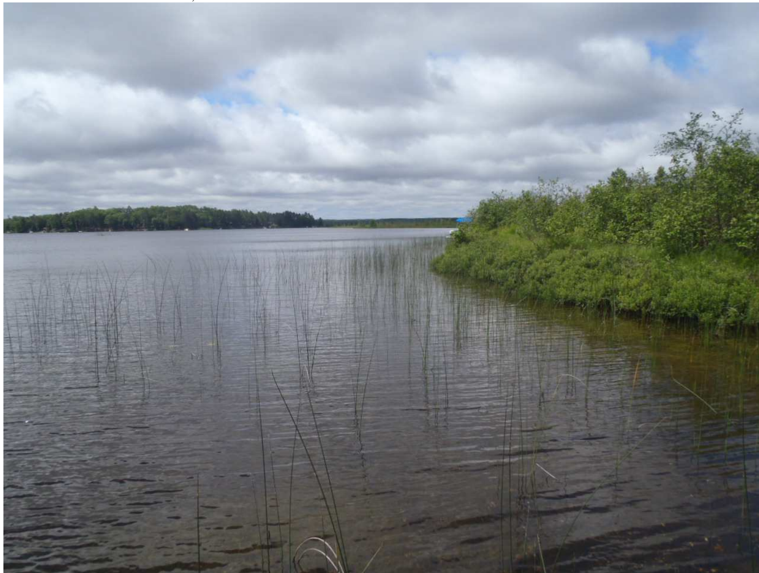
Photo 1. West shore littoral zone, Rush Lake.