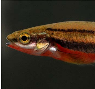
Southern Redbelly Dace