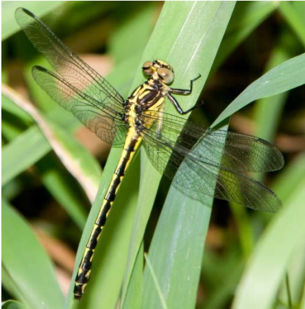
Riverine Clubtail Dragonfly