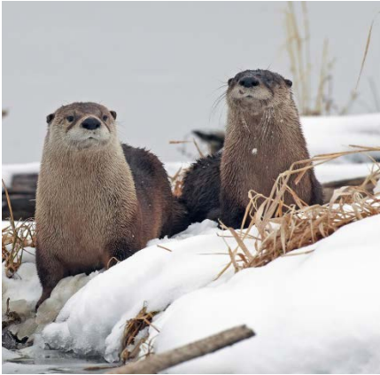
North American River Otter