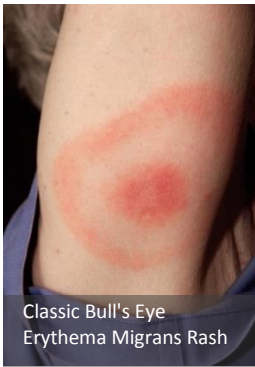
Classic Bull's Eye Erythema Migrans Rash

The initial skin lesion occurs in 60-80% of patients and will present at the site of a tick bite after 3-30 days (average 7 days). A bull's eye appearance accounts for less than 20% of all EM cases; the most common appearance is a homogeneously colored oval lesion. More photos are available at www.michigan.gov/lymeinfo under the symptoms tab.