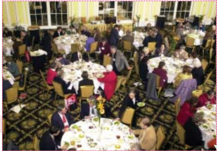
State Librarian's Excellence Luncheon