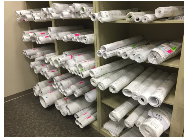
Reams of paper construction plans can now be eliminated under the new Accela system.