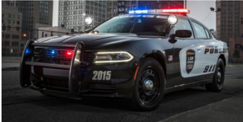
[Fleet] 2018 Dodge Charger (LDDE48) Police RWD