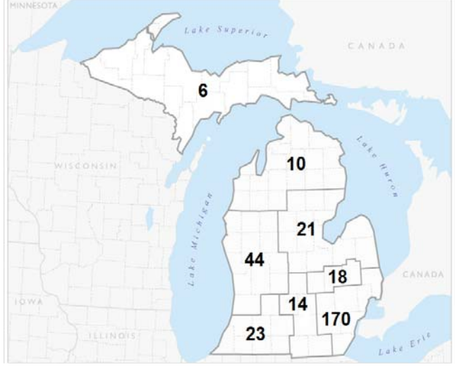
Note: Figure 2 does not include 3 out-state decisions.

Table 9 summarizes final decisions by review categories defined in MCL 333.22209(1) and as summarized below: