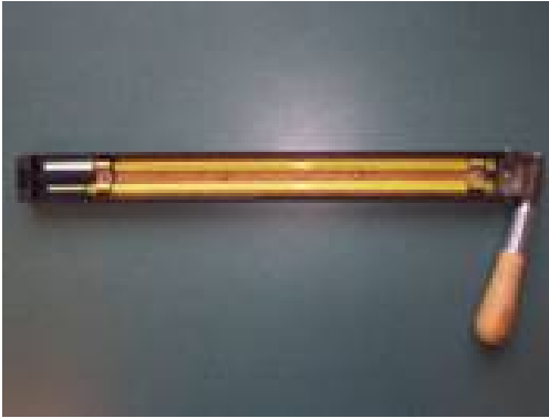
Sling Psychrometer (for measuring humidity)

Note: The bill for a recent cleanup in a private home where a window company used such a device was over $50,000.