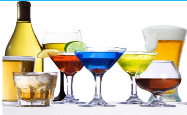
Driving after Drinking

“Nondrinkers” didn’t drink any alcohol in the past 30 days. “Current drinkers” had at least one drink of alcohol in the past 30 days. “Youth” are 9th-12th grade students attending Michigan public high schools.