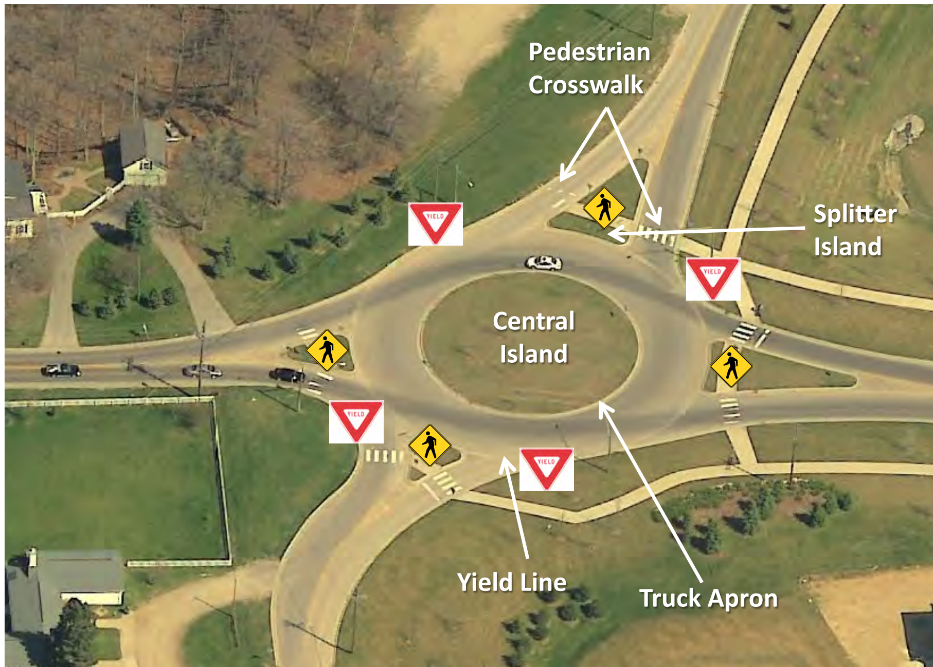
Tienken Road and Runyon Road/Washington Road Rochester Hills, MI