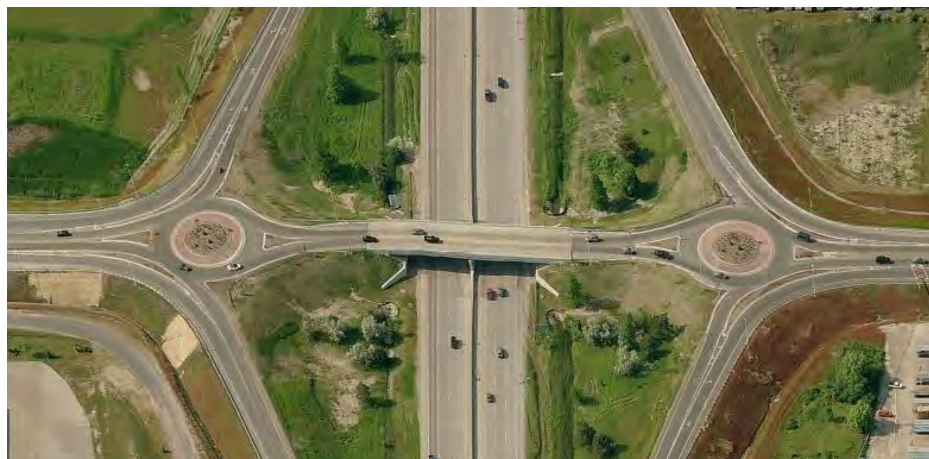
I-75 and M-81 (Washington Road) Saginaw, MI

For More Information, Please Visit: www.michigan.gov/roundabouts