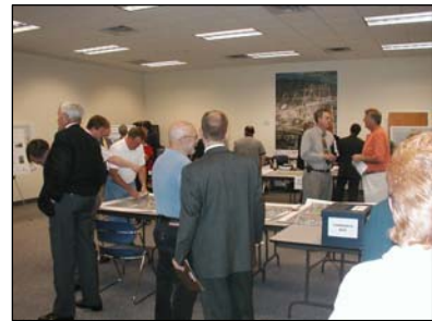
Public Meeting #3