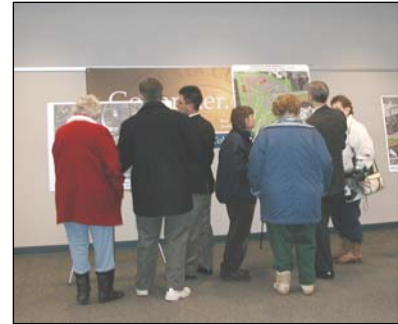
Public Involvement is an important part of the study

A full discussion of all Public and Agency Coordination which occurred prior to the release of the Draft Environmental Impact Statement (DEIS) is provided in Chapter 6 of the DEIS . The Federal Highway Administration (FHWA) and the Michigan Department of Transportation (MDOT) are required to solicit ideas and input from people and organizations that may be affected by, or have regulatory authority over, the project. FHWA and MDOT have accomplished this through the use of various tools and methods. These tools and methods will continue to be employed as this project progresses through design and construction.