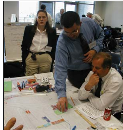
Coordination with local agencies

Public Information Meetings: The Study Team held six public information meetings to provide study information and receive comments from the general public. MDOT notified people by issuing press releases in the local newspaper, conducting interviews with local media, and mailing informational brochures to more than 400 households located in the vicinity of the plaza. Brochures for each meeting were also distributed to key city, township and county offices and to churches in the Study Area. All of the meetings were held at transit and disabled accessible facilities in Port Huron, Michigan. The meetings were held in a large hall using an open forum format. Members of the public could visit stations and discuss different aspects of the proposed project (study process, traffic, environmental constraints, etc.) with project team members. All attendees were encouraged to fill out