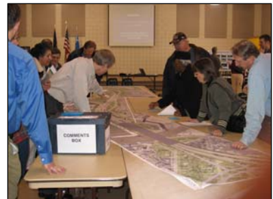
Community Involvement Workshop