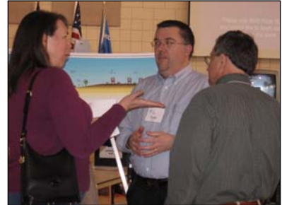
Community Involvement Workshop

Local Project Office Hours in Port Huron: Beginning in March 2007 MDOT held regular office hours on the first and third Friday of each month from 10:00 am-2:00 pm. Members of the Study Team were available to answer questions regarding the ROW acquisition process, the NEPA process, and answer other project related questions.