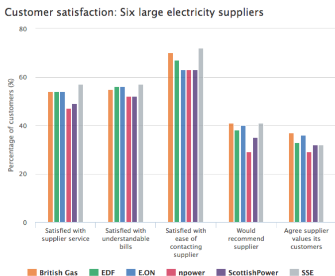
Figure 7. Customer satisfaction in the UK 68

Likewise, Denmark annually reviews its utilities' performance with its benchmarking