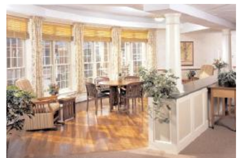
Figure 5. Interior space that incorporates environmental design