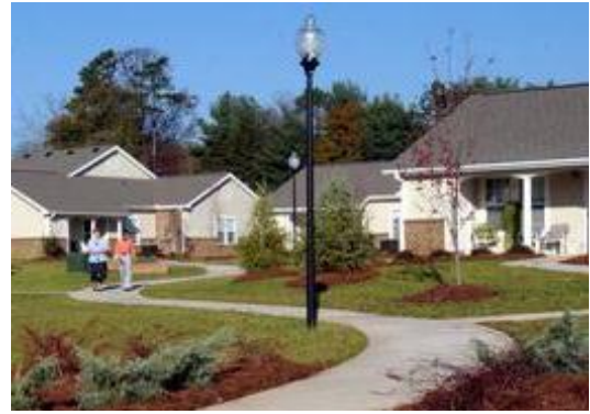
Figure 4. Senior cottage units

In a cottage housing development, groups or "clusters" of individual housing units are together around communal features, typically open space and a community building. Because cottage housing offers a communal feature, residents share in a greater sense of community while partaking in the activities or amenities provided. Specific to senior housing, cottage development allows community amenities to be concentrated in one, communal area such as a community center. This type of development has a lower impact on communities and allows seniors easier access to aid with independent ADLs.