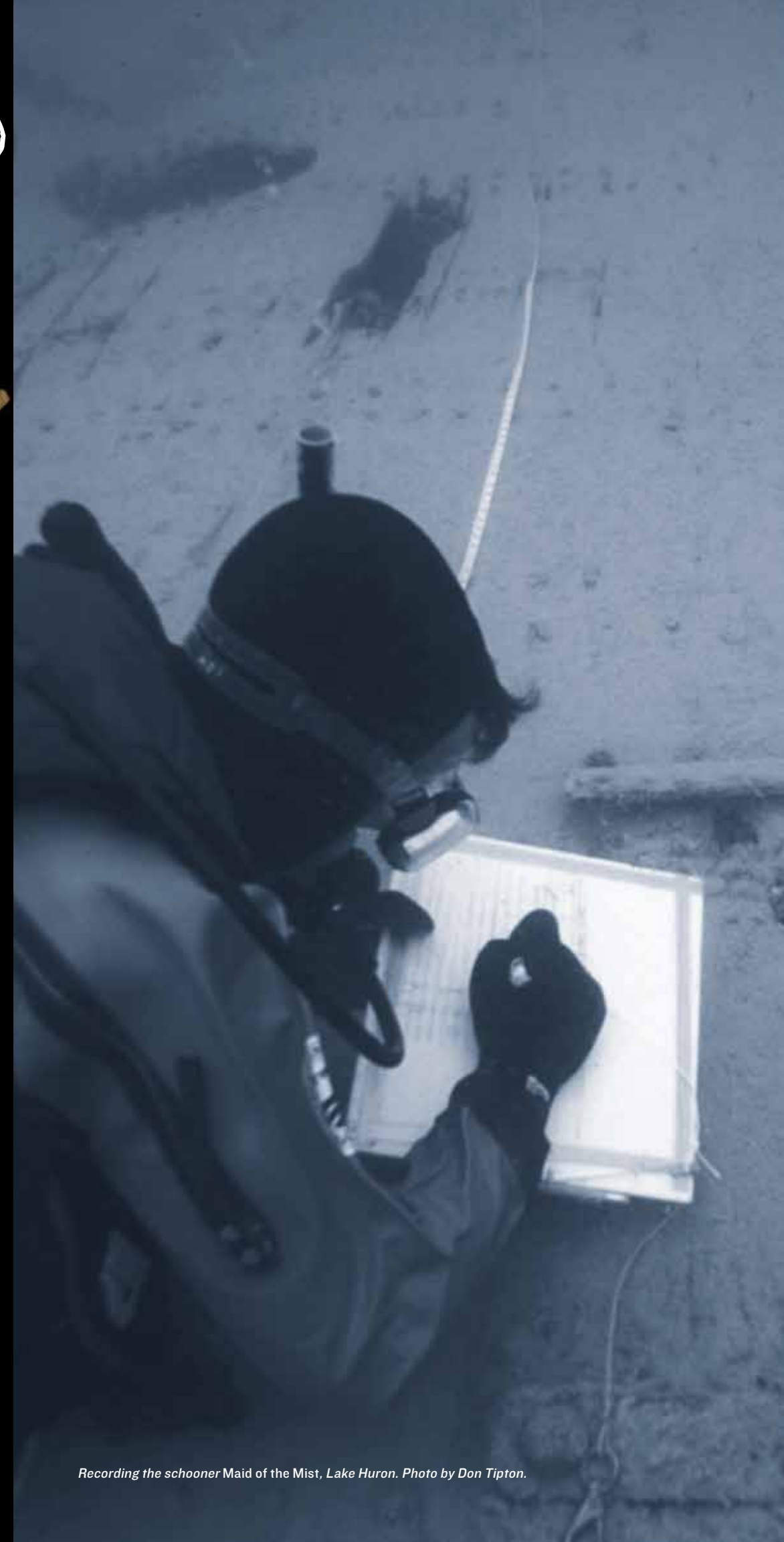
Recording the schooner Maid of the Mist, Lake Huron.