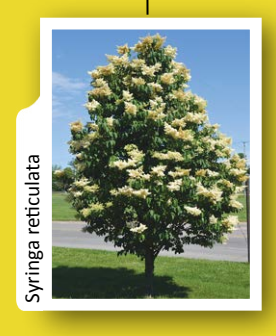
Acer spp., Amelanchier spp., Betula spp., Catalpa spp., Celtis occidentalis, Crataegus spp., Corylus colurna, Gymnocladus dioicus, Liquidambar styraciflua, Liriodendron tulipifera, Malus spp., Nyssa sylvatica, Platanus spp., Quercus spp., Syringa reticulata, Tilia spp., Ulmus hybrids