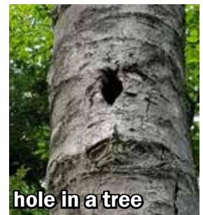
hole in a tree