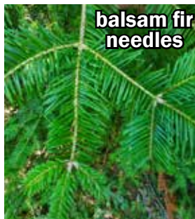
balsam fir needles