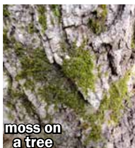
moss on a tree