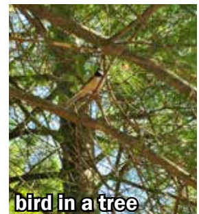
bird in a tree