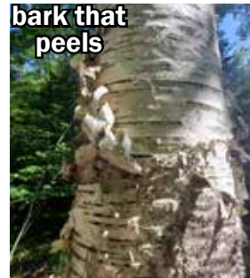
bark that peels