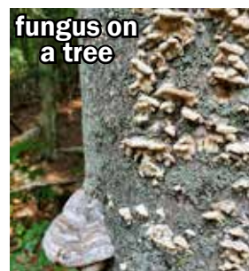
fungus on a tree