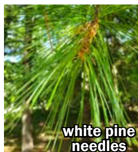
white pine needles