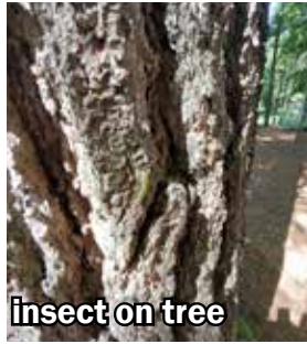
insect on tree