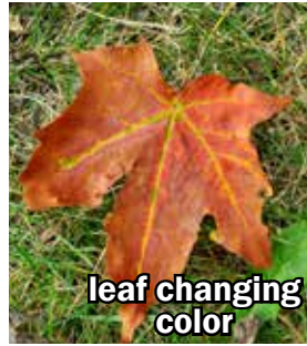
leaf changing color