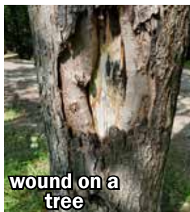
wound on a tree