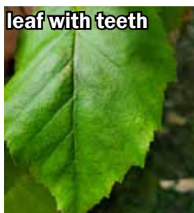
leaf with teeth