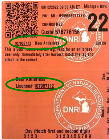
Figure 1. Deer Harvester Tag showing Kill Tag License Number (circled) to be used on submission form.