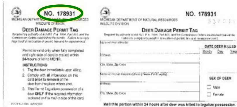
Figure 2. Deer Damage Permit Tag showing Tag License Number (circled) to be used on submission form.