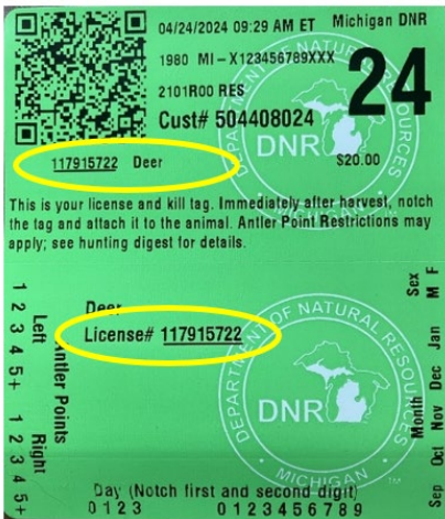
Figure 1. Deer Harvester Tag showing Kill Tag License Number (circled) to be used on submission form.