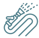
RUNNING THE HOSE

For more information on what to do after plumbing changes inside or outside the home, go to: bit.ly/391ycD0 .