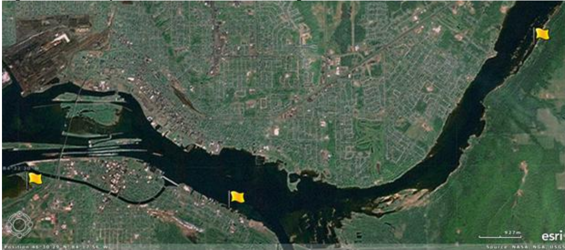
Figure 1: St. Marys River Aesthetics Monitoring Locations

The MDEQ staff communicated with the CCHD in the fall of 2011 in an attempt to coordinate the second assessment following a potential rain event causing debris to wash up on the park beach. Unfortunately, those conditions apparently did not occur in the fall of 2011. Snowfall in the winter was relatively light, so there was no major spring snowmelt to create those conditions. There was an absence of heavy spring rains in 2012, so MDEQ staff was unable to witness debris at the beach during that time as well. Finally, it was determined that the second round of monitoring needed to be completed, and if those conditions were so rare that we were unable to witness them over a period of approximately eight months, those conditions may not be persistent enough to impair one of the state's designated uses. This is a significant factor in determining whether the Degradation of Aesthetics BUI remains impaired. Therefore, the second assessment took place on Wednesday, May 23, 2012. Coincidentally, on Sunday evening, approximately 72 hours prior to the assessment, the Sault Ste. Marie area experienced a rain event where about \frac{1}{4} inch of rain fell in a relatively short period, according to CCHD staff.