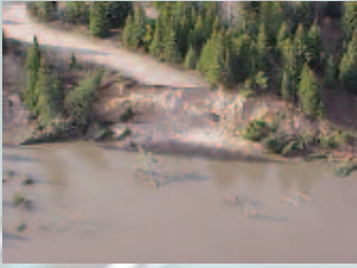
FIGURE 2: Roads were washed out along the Dead River water system.