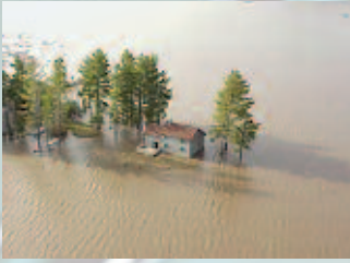
FIGURE 4: The dam failure at Silver Lake caused some $100 million in damages to homes and businesses, roads, and bridges, fisheries, soils, trees, public infrastructure, and the community's economy.

The 1998 exercise was planned by representatives from Upper Peninsula Power Company and emergency management personnel from Marquette County. This exercise involved approximately 50 to 60 emergency response personnel, including various groups from the National Weather Service, the local news media, and human service agencies (American Red Cross, Salvation Army, etc.). The exercise scenario consisted of a breach of the Hoist Dam and subsequent flooding. Emergency personnel were presented with a series of problems and asked to develop a course of action. Of course, some of those who participated said it would never happen ...but it did, just not to the extent if one of the bigger dams had breached. However, because of the exercise, all participants knew what their roles were and went to work.