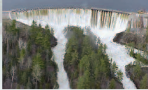
FIGURE 3: When the fuse plug in Silver Lake Dam failed, more than nine billion gallons of water unexpectedly rushed out of the reservoir and over Hoist Dam. No lives were lost and no major injuries occurred – thanks to an updated emergency action plan and a coordinated response of the part of all involved.

Silver Lake Dam is part of the Dead River Basin water system, which is approximately 25 miles long. The Silver Lake impoundment structures consist of the main earthen embankment, which incorporates a low-level outlet structure and a concrete overflow spillway, and four detached embankments (dikes) that fill low points in the reservoir shoreline near the main dam. Dike No. 2 was removed in September 2002 and was reconstructed as a fuse plug section to increase spillway capacity for extreme flood events.