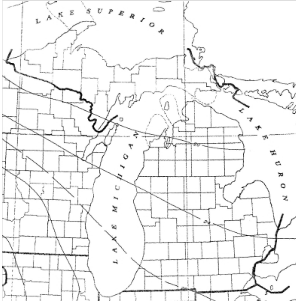
Figure 2 – May - October evaporation (in inches) from an open water surface