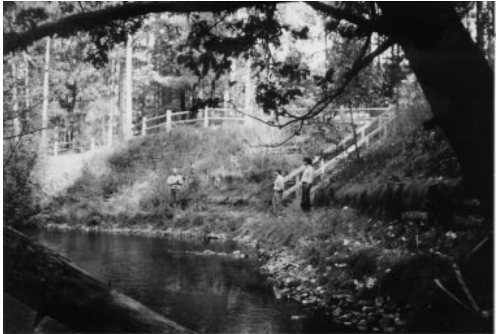
Picture 2, right: Riprap was placed to 3 feet above the ordinary high water mark and a portion back-filled with soil. Log terraces were placed on the bank and the bank was seeded. This approach can be used on top of fish lunger structures and on banks where stream flows are relatively stable. Also note the fence and stairway to direct recreationist access.

The Department supports the use of natural fieldstone for riprap; only natural fieldstone is allowed in rivers designated under the Natural Rivers program. The use of vegetation in conjunction with riprap is encouraged to “soften” stream bank structures.