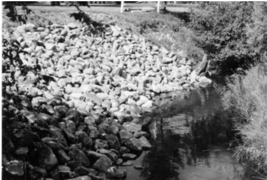
Picture 1, above: The bank was stabilized with rock riprap from the toe (bottom) of the bank to the top of bank. This may be needed on streams with unstable hydrology (i.e. “flashy” streams), and where banks have groundwater seeps.

Riprap is one of the more commonly used stream bank stabilization techniques. It is a permanent cover of rock used to stabilize stream banks, provide in-stream channel stability, and provide a stabilized outlet below concentrated flows. It is generally used on stream banks at the toe (bottom) of the slope, with other structures placed up-slope to prevent soil movement. It is often a component of many soil bioengineering techniques. Specifications for riprap used in stream bank stabilization is discussed in the Riprap BMP .