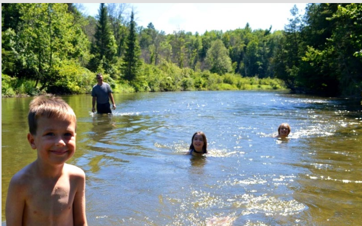
Children swimming in the Manistee River.

Routine testing has shown E. coli levels in many areas are above the water quality standard (WQS). E. coli is used as an indicator for fecal contamination and the WQS is designed to protect human health during recreation. When the WQS is exceeded, the federal Clean Water Act requires that Michigan develop a TMDL to provide a framework for restoration of water quality. Sources of E. coli are ever present due to human occupation, and include livestock, improper or incomplete sewage treatment (failing septic systems, leaking sewer systems, combined and sanitary sewer overflows, and illicit connections), pets, and nuisance levels of wildlife. Given the extent of this problem and the multitude of potential sources, a statewide approach is more effective and efficient at addressing this issue. The Statewide E. coli TMDL, approved by the U.S. Environmental Protection Agency (U.S. EPA) in 2019, provides a general legal framework for reducing pollutant loads in areas where the E. coli WQS is exceeded.