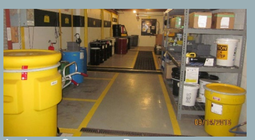
Indoor Storage Rooms