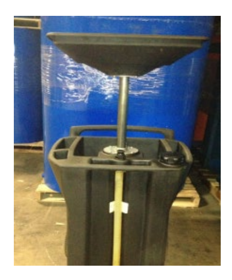
Non-pressurized mobile oil drain pan