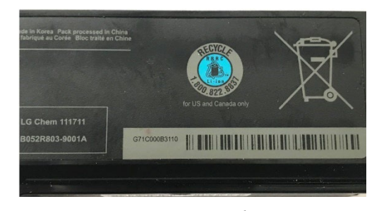
Lithium-ion computer battery

Lithium ion batteries are rechargeable and come in many different shapes and sizes. They are becoming more and more popular because they are smaller, more powerful, and last longer than dry cell alkaline batteries. Lithium ion batteries are found in all kinds of products like electric vehicles, cell phones, laptops, tablets, cordless power tools, and other handheld rechargeable gadgets. Some are