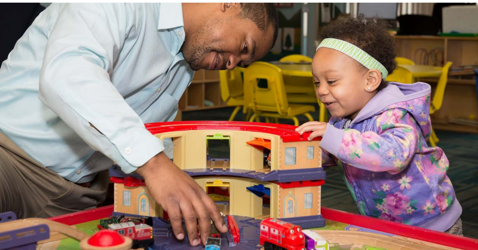
Photo taken at Starfish Family Services in Inkster