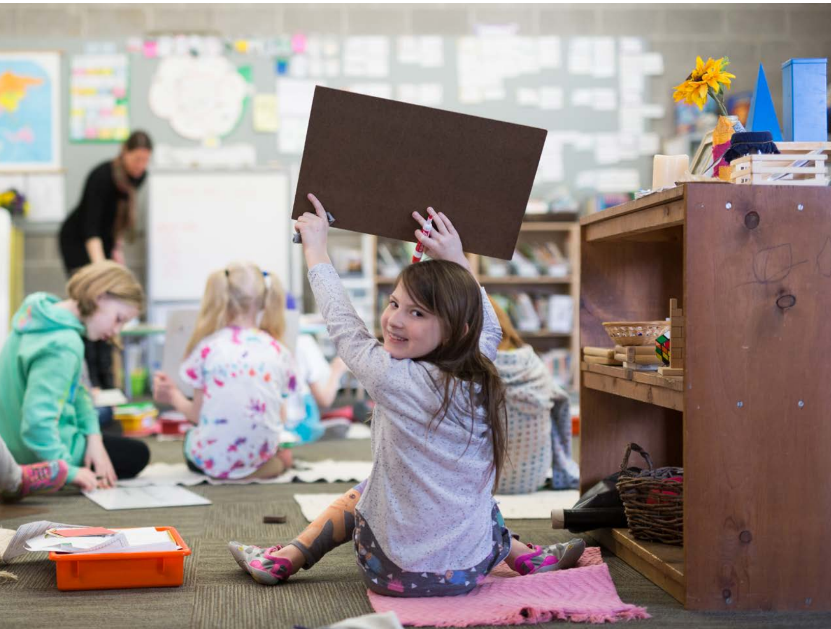
Photo taken at Walden Green Montessori in Spring Lake