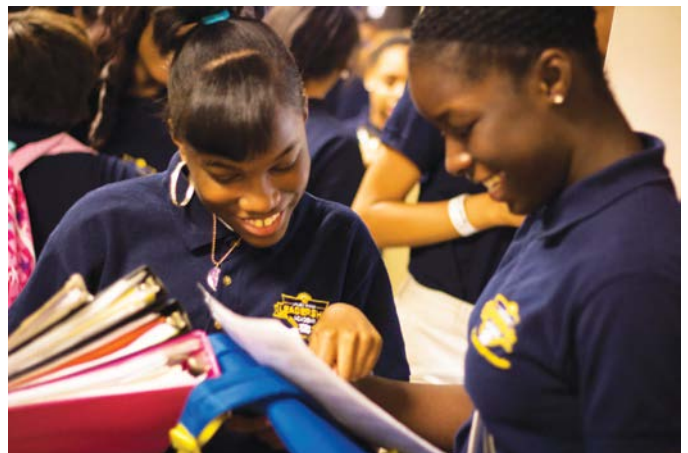
Photo taken at Jalen Rose Leadership Academy in Detroit

Too many Michiganders face an uphill climb when enrolling in postsecondary education. Students face both financial and academic challenges. While state investment in higher education has steadily increased since its low point in FY 2012, Michigan's investment is down 14 percent from appropriations in FY 2008. 7 At the same time, tuition at colleges and universities statewide has been on the rise, and state aid programs have been cut or eliminated. 8 This has increased the financial investment required for students to pursue postsecondary education. In addition to financial barriers, too often students enter postsecondary education underprepared. One in four graduates of the class of 2014 were required to take remedial courses when they enrolled in a community college or public university. 9 Michigan must reverse these trends to put more students on the pathway to success.