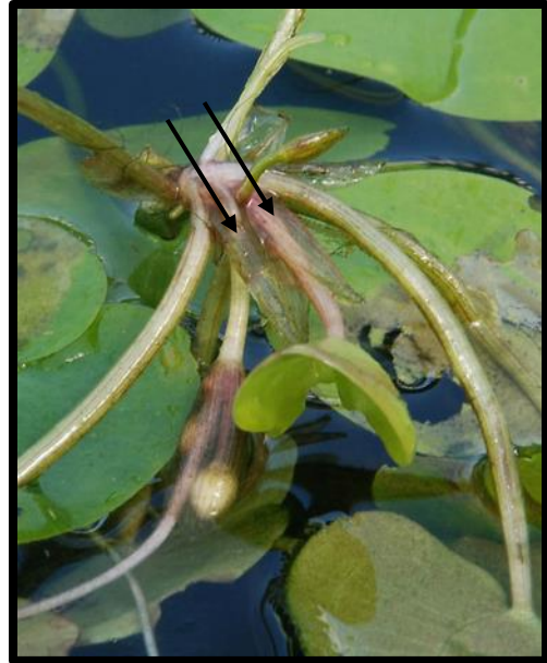
Figure 2. The two arrows point to the two transparent leaf-like stipules at the base of the petioles of European frog-bit ( Hydrocharis morsus-ranae L.). American frog-bit ( Limnobium spongia (Bosc) Rich. ex Steud.) has only one stipule.

European frog-bit seedlings can be difficult to distinguish from duckweed species: common duckweed ( Lemna minor L.) and greater duckweed ( Spirodela polyrrhiza (L.) Schleiden). The roots of duckweed species arise from the underside of their leaves while the roots of EFB arise from the base of a rosette or leaf petiole (Catling et al. 2003).