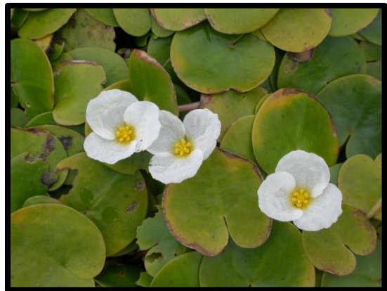
Figure 1. European frog-bit ( Hydrocharis morsus-ranae L.) in bloom.

European frog-bit is an herbaceous, free-floating, freshwater aquatic plant. Its leaves are entire, cordiform (heart-shaped) or slightly orbicular (circular), and arranged in a floating rosette (Figure 1). Its leaves are 0.47 – 2.4 in (1.2 – 6 cm) long and 0.51 – 2.5 in (1.3 – 6.3 cm) wide. Some leaves may be emergent when it is growing in dense floating mats. Its petioles (leaf stalks) are slender and have two translucent stipules at their base (Figure 2).