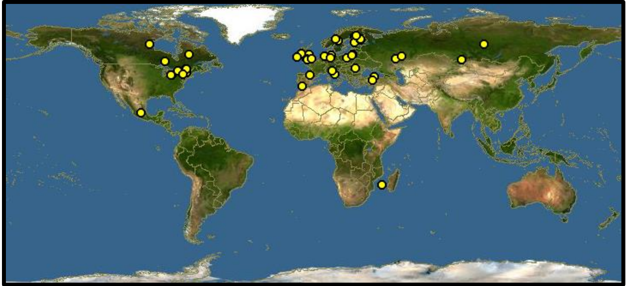
Figure 5. Global distribution of European frog-bit ( Hydrocharis morsus-ranae L.).

European frog-bit tolerates a wide range of climatic conditions across its native range (Catling et al. 2003). It is found in fresh to slightly brackish water with low salinity ( \leq 2 ppt; Luther 1951 in Sculthorpe 1967) and favors mesotrophic to oligo-mesotrophic conditions (Cook and Lüönd 1982; Murphy 2002). It has also been found in eutrophic conditions (Suominen 1968; Pitkänen et al. 2013). It occurs in calm to slow moving water with high conductivity ( >300 \mu\text{S cm}^{-1} ), near neutral pH (7.0 – 8.0), and organic substrate (Husák and Gorbik 1990; Murphy 2002; Sager and Clerc 2006; Steffen et al. 2014). European frog-bit inhabits small waterbodies and inlets, bays, and coves of larger waterbodies and is frequently found in ditches, canals, backwaters, peat diggings, and oxbow lakes (Cook and Lüönd 1982). Associated species include Typha spp., tufted sedge ( Carex elata Mack.), grass-like sedge ( Carex panicea L.), swamp sawgrass ( Cladium mariscus (L.) Pohl), L. minor , floating fern ( Salvina natans (L.) All.), S. polyrrhiza , N. lutea , arrowhead ( Sagittaria sagittifolia L.), common bladderwort ( Utricularia vulgaris L.), P. natans , small pondweed ( Potamogeton pusillus L.), shining pondweed ( Potamogeton lucens L.), reed manna grass ( Glyceria maxima (Hartm.) Holmb.), star duckweed ( Lemna trisulca L.), and C. demersum (Husák and Gorbik 1990; Murphy 2002; Sager and Clerc 2006; Steffen et al. 2014).