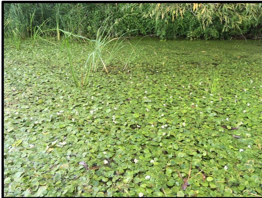
Figure 4. Floating mat of European frog-bit ( Hydrocharis morsus-ranae L.) in a canal on Harsens Island, Michigan.

European frog-bit is typically found in calm to slow moving waterbodies in areas protected from wind and wave action (e.g., shorelines, wetlands, inlets). In the Great Lakes region, EFB occurs across the major wetland vegetation zones (i.e., emergent, floating, submerged vegetation). Dense floating mats of EFB are typically found in the floating vegetation zone or in sheltered openings of the emergent vegetation zone (Figure 4; Halpern 2017; Wellons 2018). European frog-bit detection efforts are best conducted from early summer to early fall when its leaves are floating on the surface of the water (Catling et al. 2003). European frog-bit plants have been documented on the surface of the water beginning in May in the Lower Peninsula of Michigan and in late June to early July in the Upper Peninsula (Cahill et al. 2018). When growing in the floating and submerged vegetation zones, EFB can typically be detected via visual searches from a boat or land. More intensive sampling may be required for detection when EFB is growing among emergent vegetation.