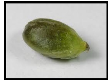
Figure 3. A turion of European frog-bit ( Hydrocharis morsus-ranae L.).