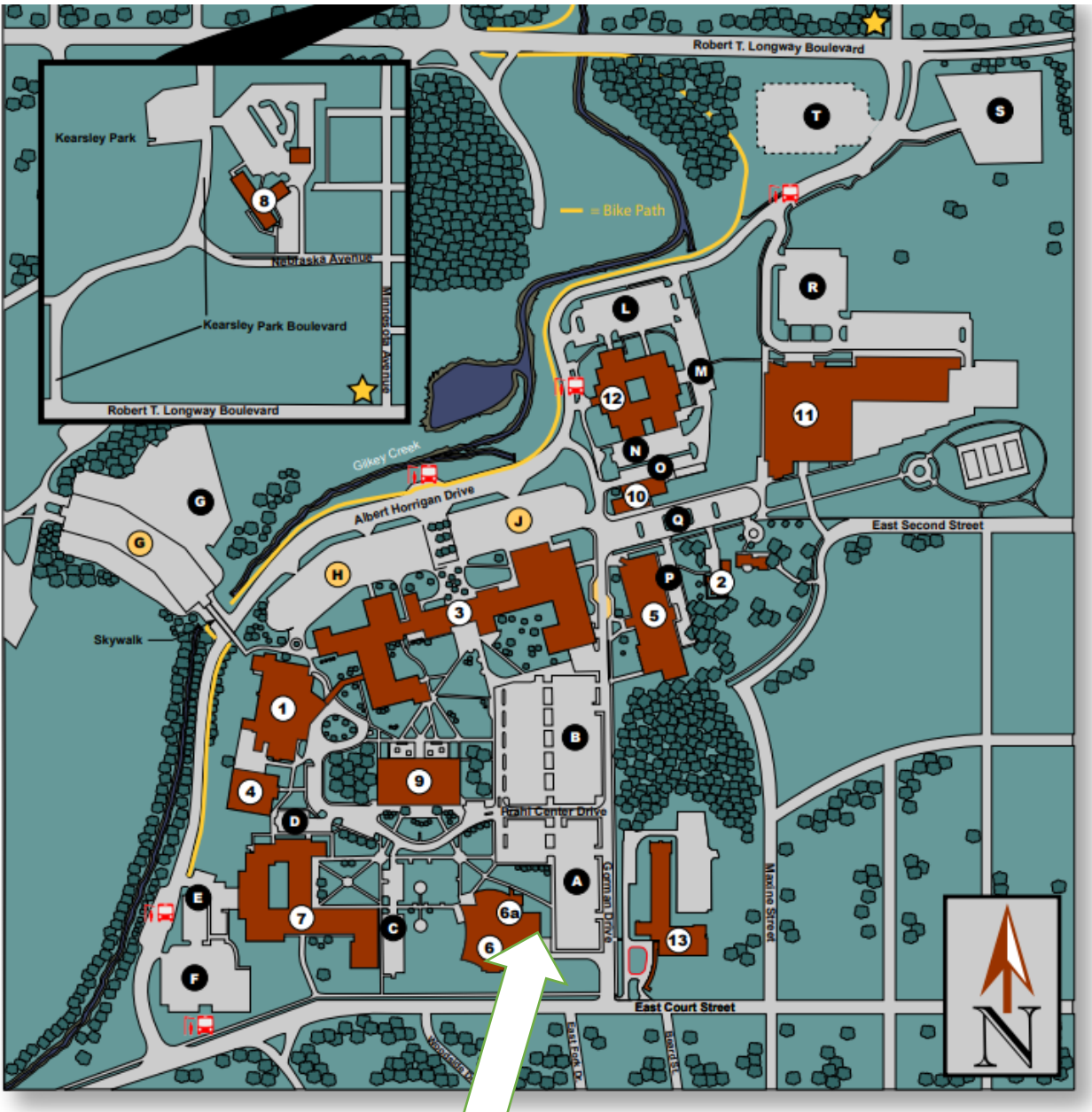
Event Center and Parking

The Event Center is located at 6a as you enter off Court Street. Parking should be available in lots A or B. Lot B is a pay lot and is $1 per day.